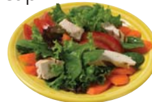
1 cup of lettuce* and ½ cup of other vegetables