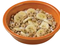
1 small banana